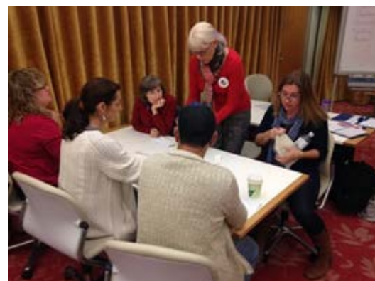
Write Links members working on a story.